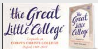
The Great Little College

These products are available through our website: ccc.ox.ac.uk/merchandise