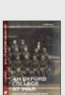
An Oxford College At War