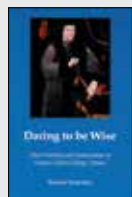
Daring to be Wise