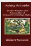
Raising the Ladder