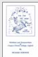
The Fox, The Bees and The Pelican