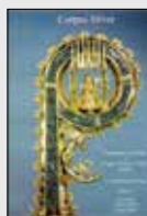
Corpus Silver - Patronage & Plate