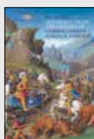
Treasures from the Library